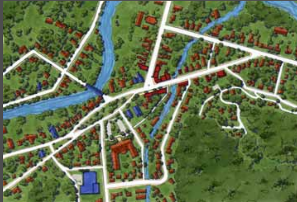
The town plan and images of Woodstock, Vermont