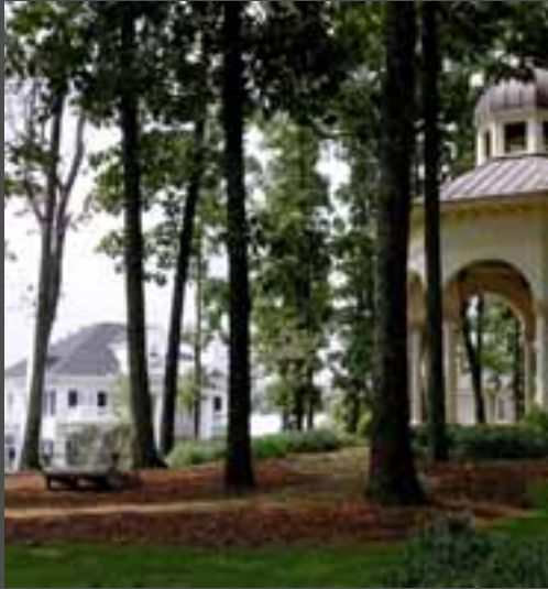
Examples of Pattern Book landscapes