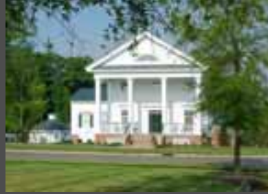
Examples of neighborhoods built from UDA Pattern Books