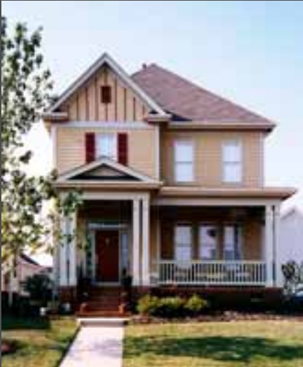
Examples of new pattern book houses